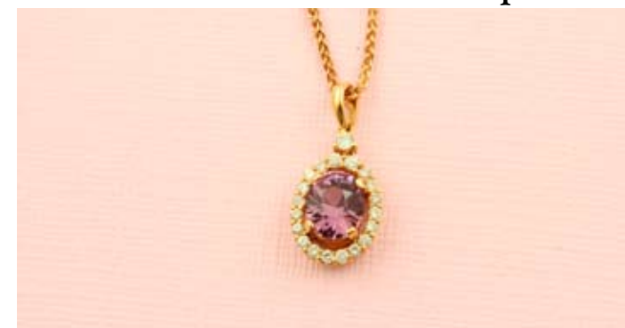
Celebrate August birthdays with this stunning spinel pendant! 18k 1.44ct oval purple spinel pendant with chain $1795