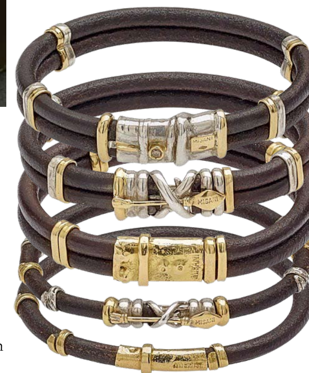
Imported from Italy!

It's not everyday we receive an international delivery. Shortly after we returned from Las Vegas, we were delighted to receive one of our JCK show treasures direct from Italy! We could hardly contain our excitement at opening up our first shipment of Misani men's Italian leather bracelets! These hand-crafted bracelets retrace the route of the great journeys of 18th century nobleman and their quest for adventure. Come in today and experience the style and excitement of Misani leather bracelets for yourself.