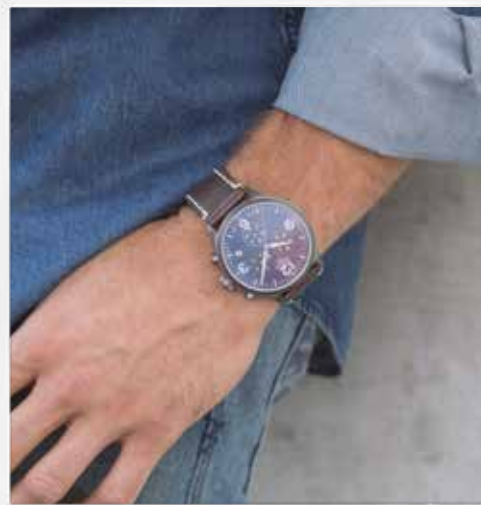
Dad June 17