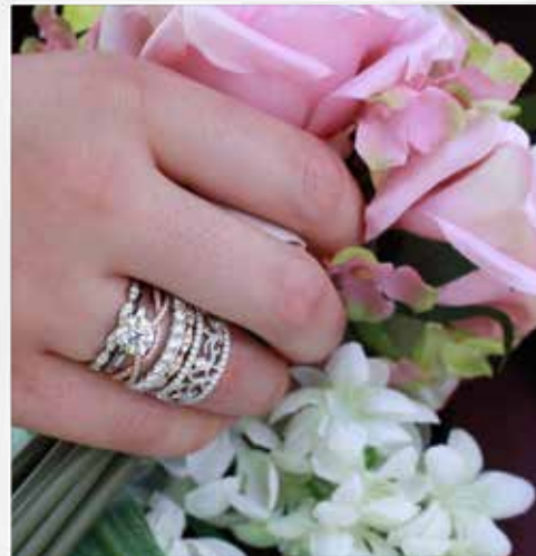
Love weddings and anniversaries