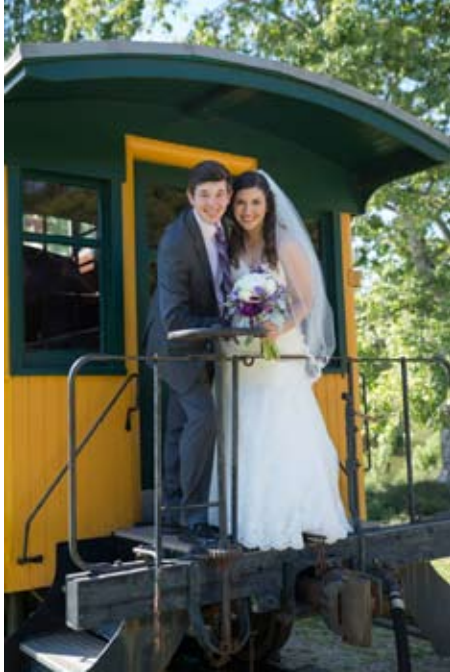
A Joyful Moment!