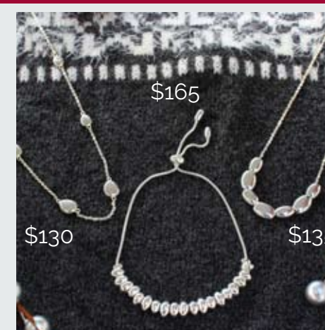
A trendy silver accessory for your friends, coworkers or teachers.