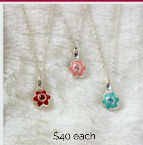
Coordinating flower necklaces for your young daughters or granddaughters.