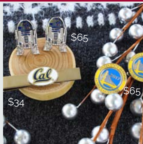
A tie bar or cufflinks for your brother, uncle or son.