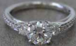
14K White Gold 1.25ct Center Diamond & .49ctw Accent Diamond Three Stone Ring