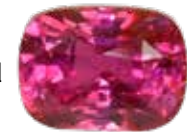
2.56ct Pink Sapphire