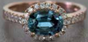
14K Rose Gold 1.85ct Blue Zircon & Diamond East West Halo Ring