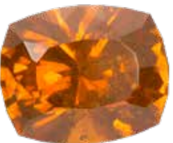
9.87ct Hessonite Garnet