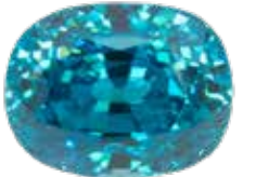
11.16ct Blue Zircon